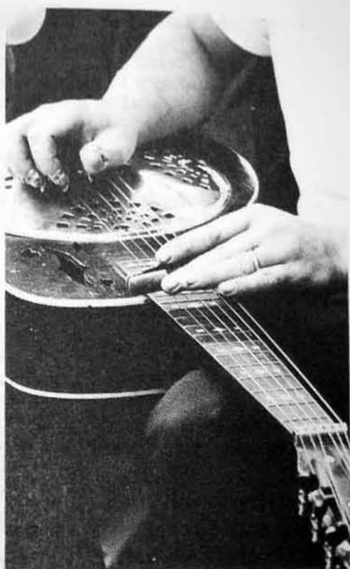
It's a dobro.